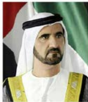
صاحب السمو الشيخ محمد بن راشد آل مكتوم نائب رئيس الدولة - رئيس مجلس الوزراء - حاكم دبي HIS HIGHNESS SHEIKH MOHAMMED BIN RASHID AL MAKTOUM VICE PRESIDENT AND PRIME MINISTER OF THE UAE AND RULER OF DUBAI