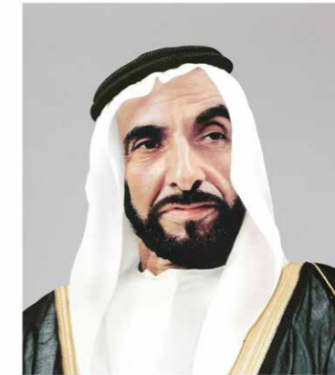
المغفور له بإذن الله الشيخ زايد بن سلطان آل نهيان تفقدته الأمة بواسع رحمته SHEIKH ZAYED BIN SULTAN AL NAHYAN