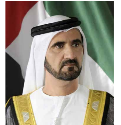
صاحب السمو الشيخ محمد بن راشد آل مكتوم نائب رئيس الدولة رئيس مجلس الوزراء حاكم دبي HIS HIGHNESS SHEIKH MOHAMMED BIN RASHID AL MAKTUUM VICE PRESIDENT AND PRIME MINISTER OF THE UAE AND RULER OF DUBAI