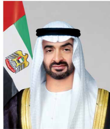
صاحب السمو الشيخ محمد بن زايد آل نهيان رئيس دولة الإمارات العربية المتحدة HIS HIGHNESS SHEIKH MOHAMED BIN ZAYED AL NAHYAN PRESIDENT OF THE UNITED ARAB EMIRATES